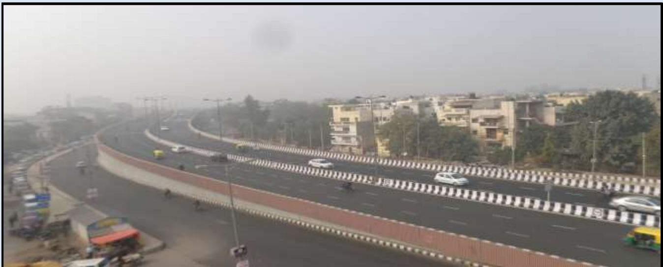
Elevated Corridor from Prembari Pul to Azadpur