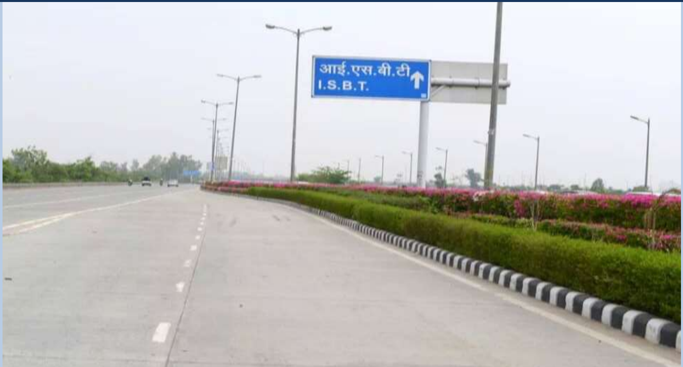
Central Verge of Ring Road Bypass near Yamuna River