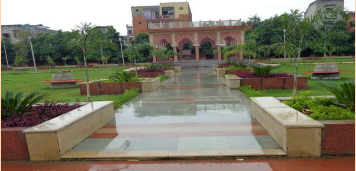
Delhi Institute of Hotel management and Catering Technology