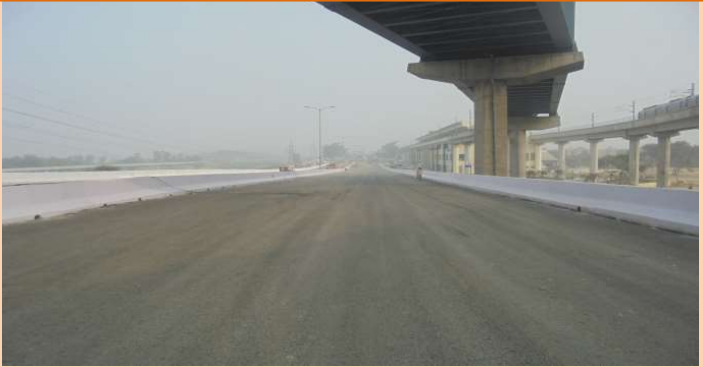
Flyover from Mangolpuri to Madhuban Chowk