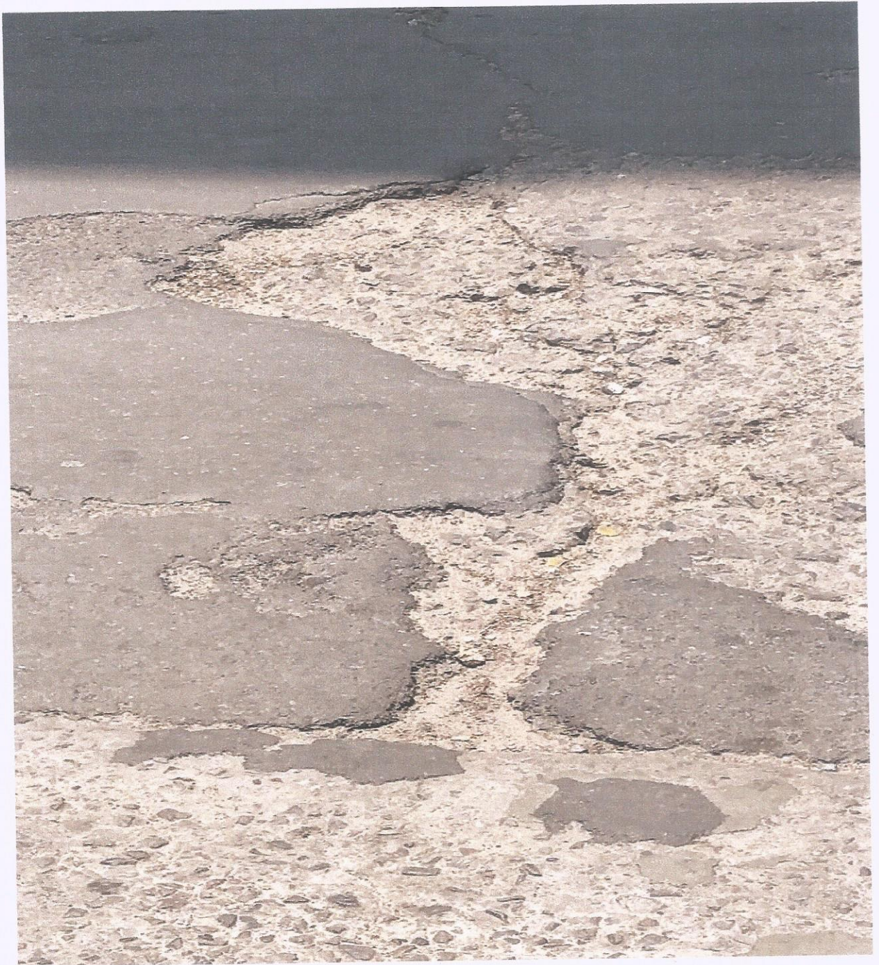
Near Pillar of Jahagirpuri Metro Station