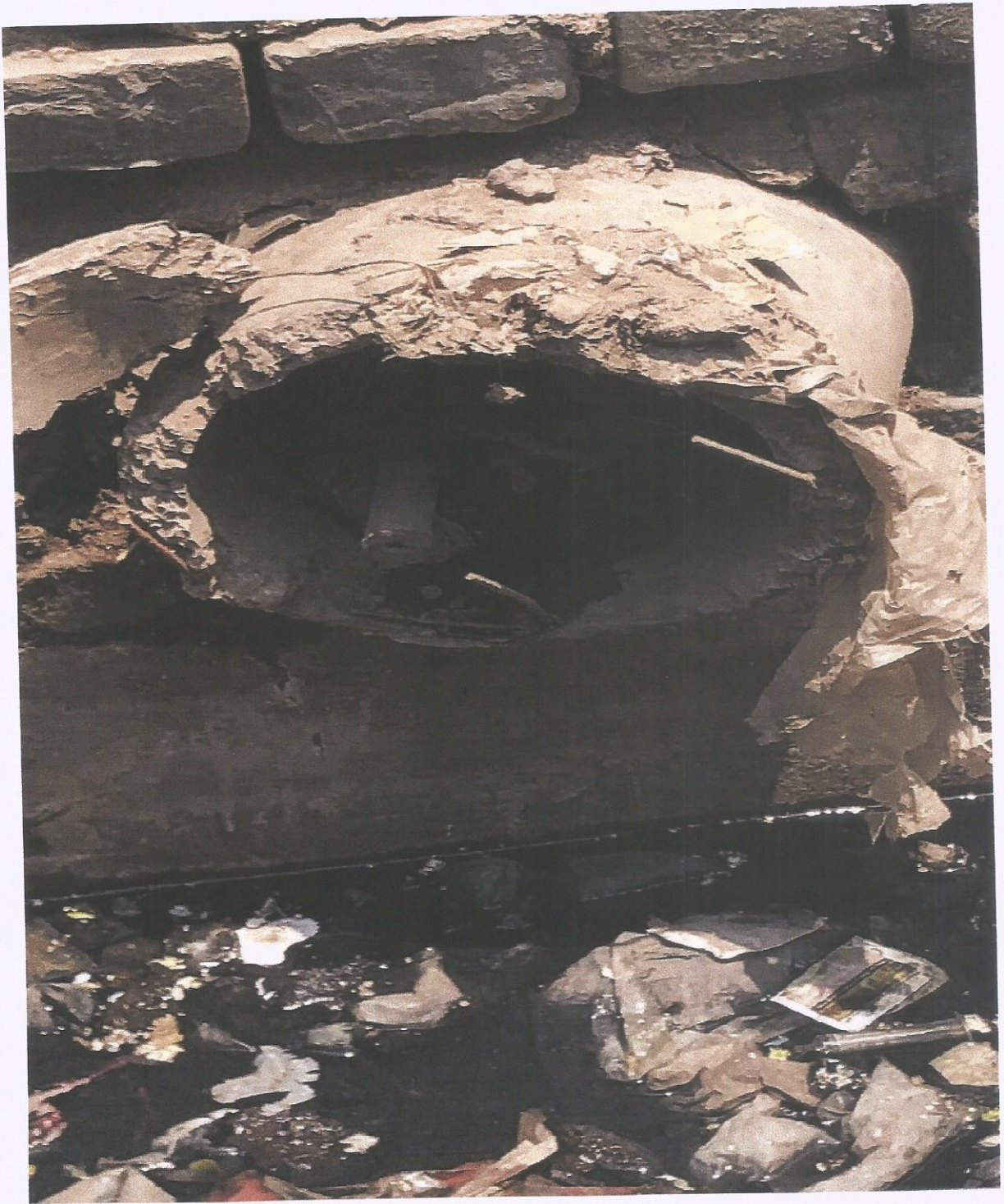
Bell Mouth Choked Near Pillar No. 132