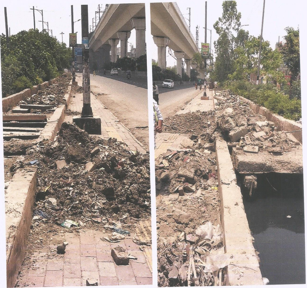
Silt to be removed from Mall Road Ext.