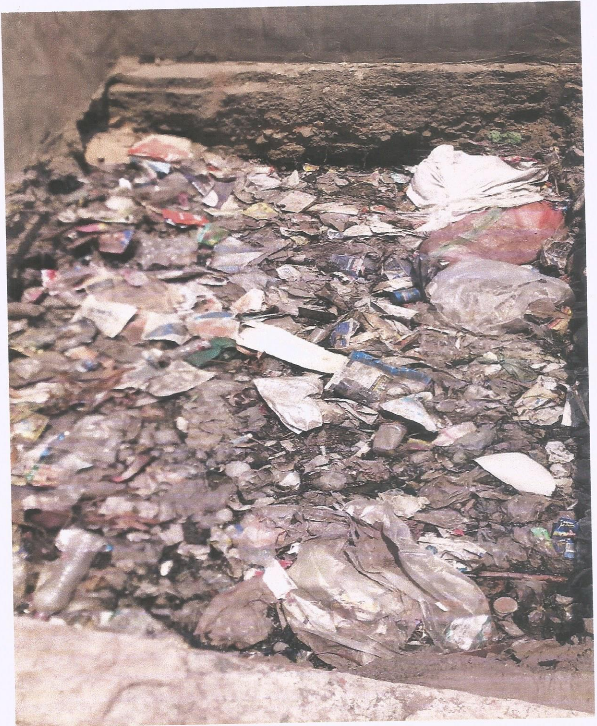
Chamber Near Main Jahangirpuri road